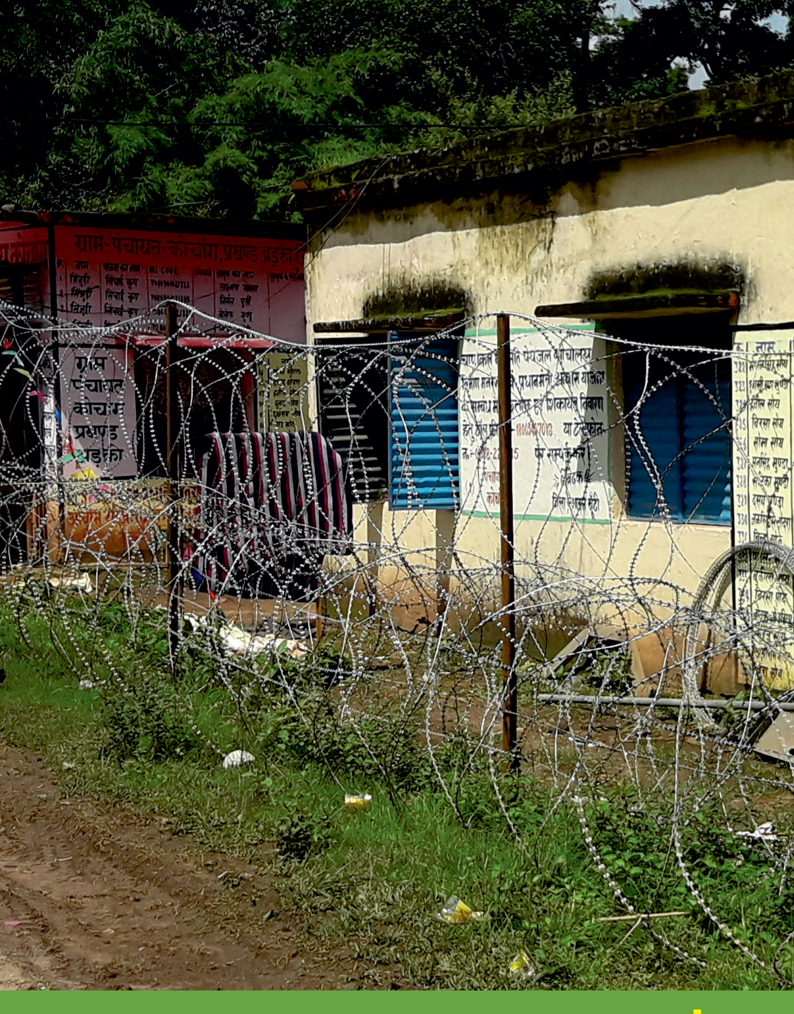
Occupation of Paramilitary Forces and barbed fencing at a Panchayat Building at Khunti, Jharkhand 2018