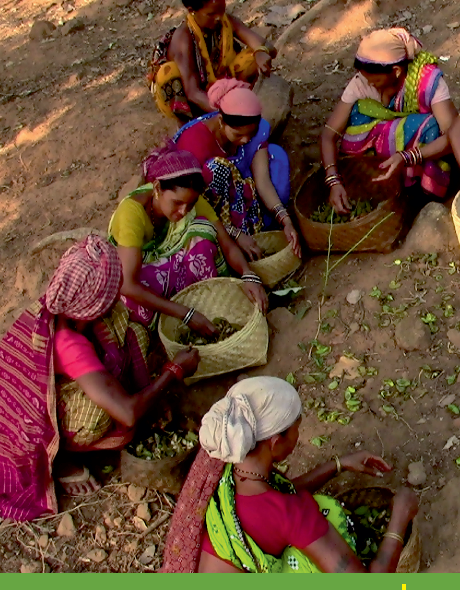
women collecting Minor Forest Produce in Kandhamal district, Odisha 2017